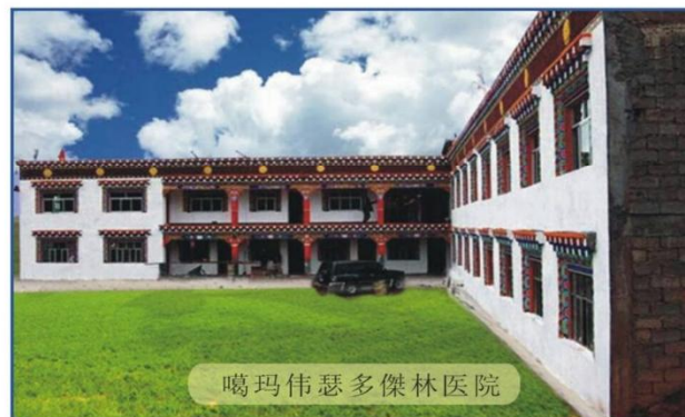
Pic 2: Karma Wesel Doe-joe Ling Hospital

In 2005 Rinpoche initiated the construction of a Tibetan hospital. The project aims to provide basic health care as well as emergency care, surgical services and education to the people of the region. It is also, wherever possible, free of charge for the people of the Nangchen County. The hospital comprises 5 small rooms, 30 large rooms and a main prayer hall. It is Rinpoche's heart's desire that one day modern academic medicine will also be available, including x-ray and ultrasound machines, laboratories and an intensive care unit. He hopes that in future Western medical doctors will work at the hospital for a period of time.