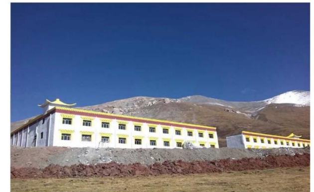
Pic 4: KWDL Medical School, construction in progress

Pal Demo people are famous for producing Tibetan herbal medicine. The methods of making these precious healing pills have been passed down for hundreds of years, and are highly sophisticated. Extensive prayer rituals must accompany the collecting, drying and preparing of herbs.