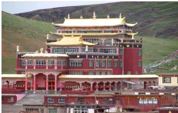
Pic 1: Pal Demo Tashi Choe-Ling Monastery